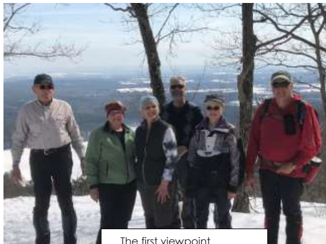
The first viewpoint overlooking Moreau