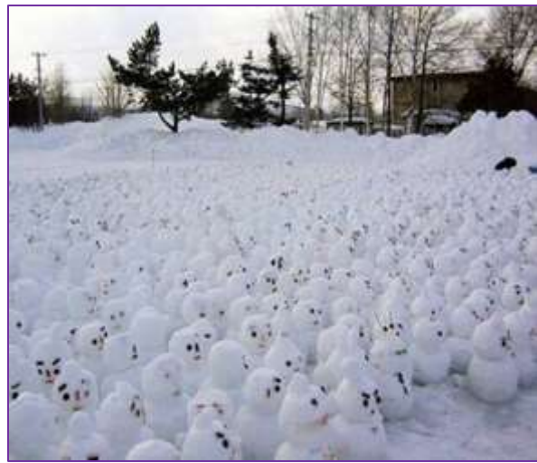
On their way to the next Foothills meeting!